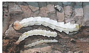
Second, Third, and Fourth Stage Larvae.