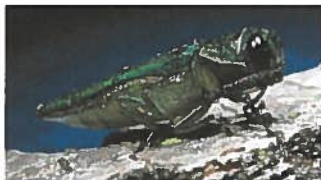
Adult Emerald Ash Borer.

WWW.GEORGINAISLAND.COM AND CLICK ON THE ENVIRONMENT LINK.