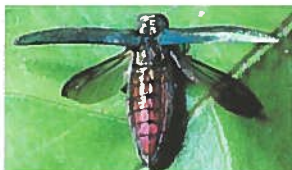
Purplish Red Abdomen on Adult Beetle.