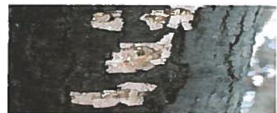
Jagged Holes Left by Woodpeckers Feeding on Larvae.