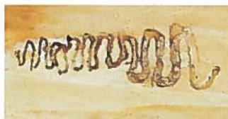
Gallery of an Emerald Ash Borer Larva.